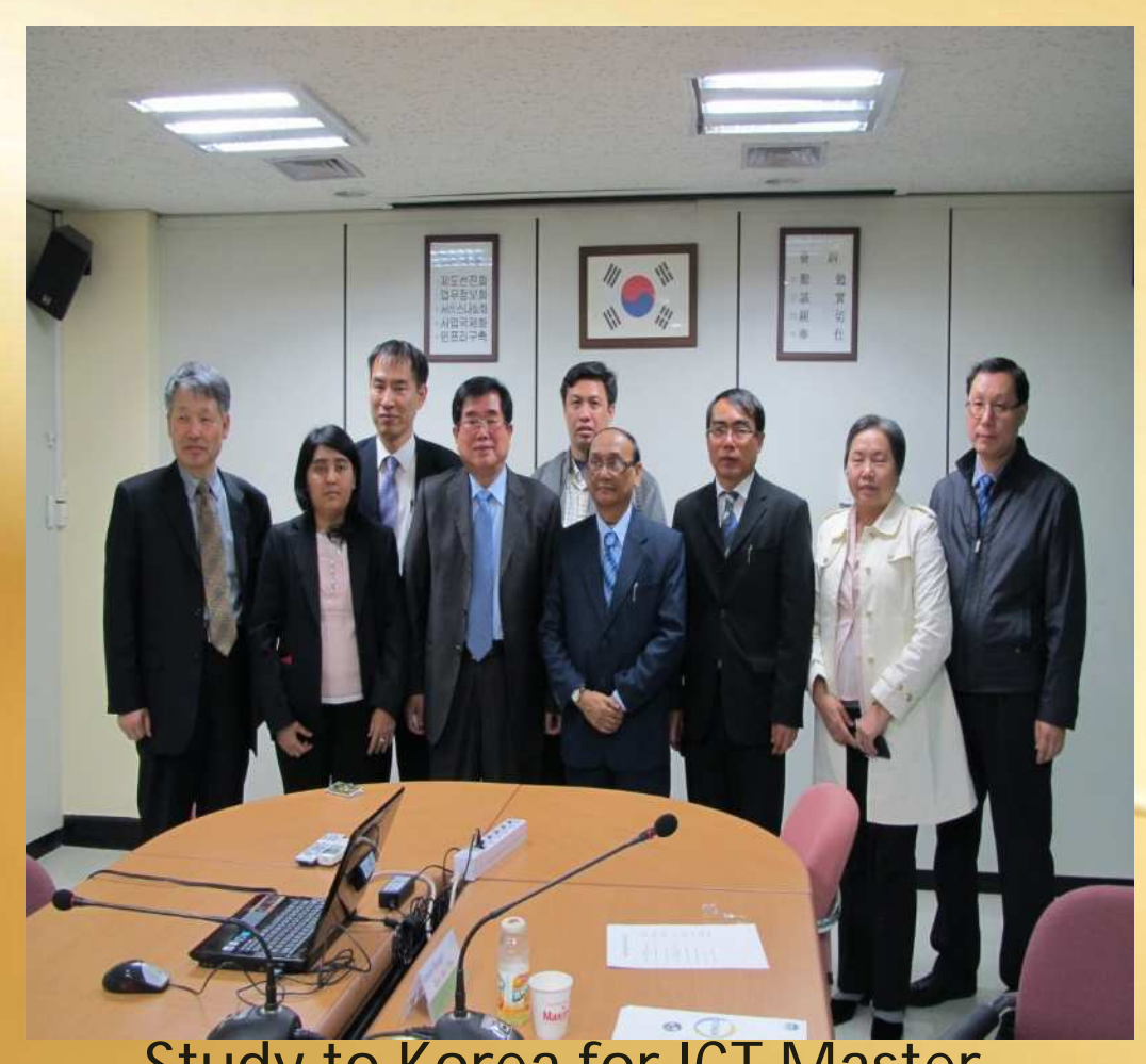
Study to Korea for ICT Master Plan preparation